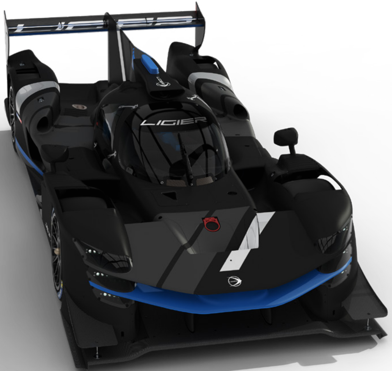
LIGIER JS PX

With the Ligier JS PX, Ligier introduces its first unique car. An exceptional model to celebrate Ligier's trifecta with the overall victory in the 24 Hours of Daytona, 12 Hours of Sebring and Petit Le Mans.