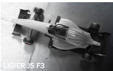
LIGIER JS F3