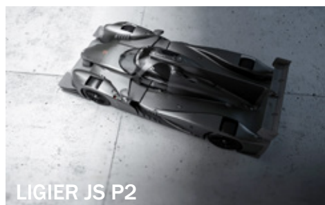
LIGIER JS P2