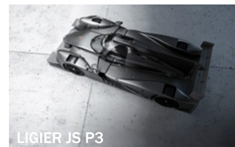
LIGIER JS P3