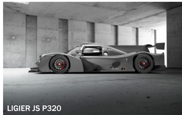
LIGIER JS P320