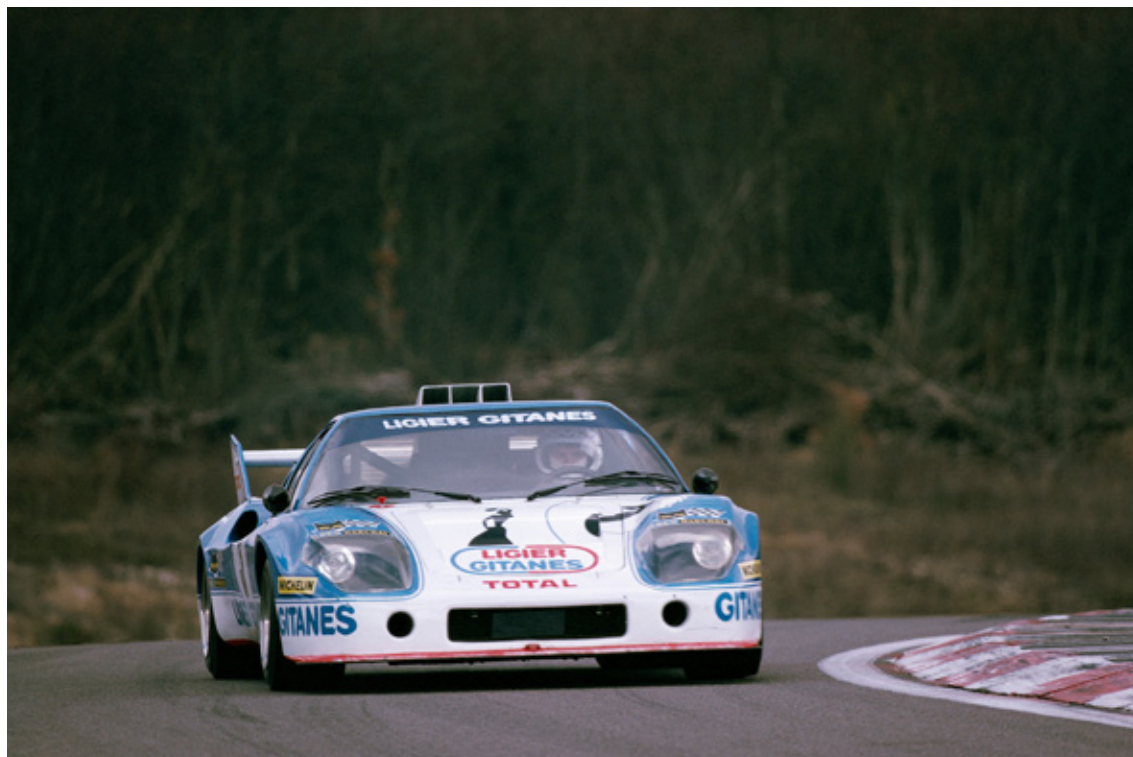
Ligier JS2 - 1975