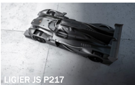
LIGIER JS P217