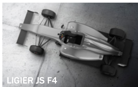
LIGIER JS F4