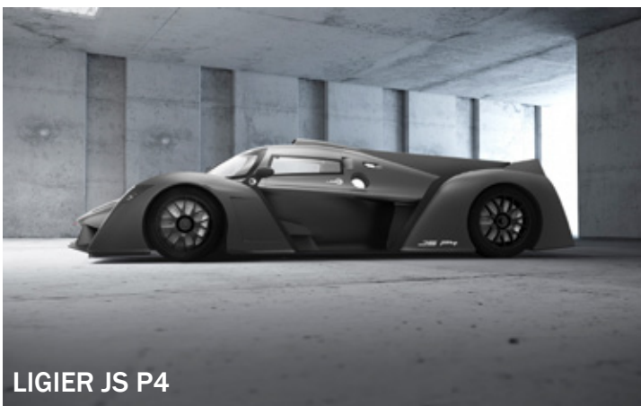
LIGIER JS P4